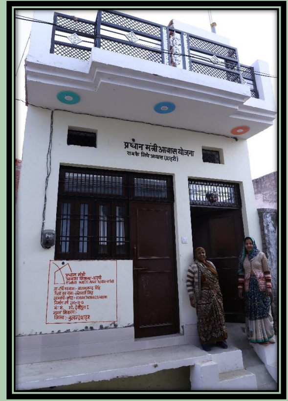
Bal Mukund Singh Bulandshahr